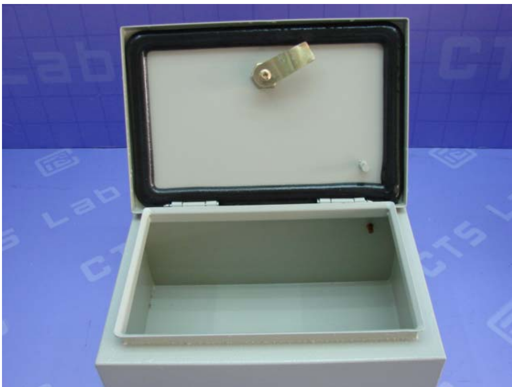
Figure 2 (inner view)